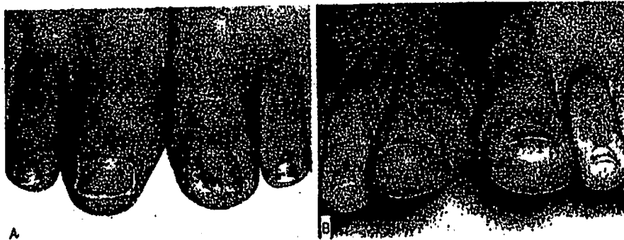
Figure 3. Bilateral ingrown toenails in 19-year-old soldier. (a) Dorsal view. Contoured right toe with no excess of soft tissue, 10 months following recommended surgical treatment of ingrown nail. Left ingrown nail has large area of soft tissue both medial and lateral to the nail; with weight bearing, this nail would become buried in soft tissue. (b) End-on view, showing more dramatically the lack of soft tissue bulge on right as compared with the overriding of soft tissue on left. Note that nails actually are the same width, but the left appears only about half as wide as the right because of the soft tissue bulge.

A 19-year-old Army private had been unable to perform infantry duty for 8 months because of severe unguis incarnatus of the right great toe. Surgical