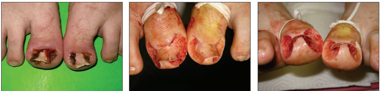
Fig. 1. Examples of the severity of ingrown toenails surgically corrected by soft-tissue nail-fold excision. The preoperative appearance ( left ) highlights the extensive medial and lateral nail-fold granulation tissue. The images obtained in the postoperative period ( centre, right ) show the surgical site following nail-fold excision. The excision of soft tissue was typically generous and adequate, with all portions of the granulation tissue removed.

Mesh tulle gauze ( 10 \times 10 cm) was folded and applied over the site of the excision followed by 2 gauze pads ( 5 \times 5 cm) and a snug dressing of rolled gauze (5-cm width). The patients were instructed to soak their feet after 48 hours in a warm water bath for 15–20 minutes, during which time the dressings were removed and replaced with new clean dressings. Patients were instructed to subsequently soak their toes 3 times per day for 15–20 minutes in a warm water bath for 4–6 weeks. Pain control was achieved with