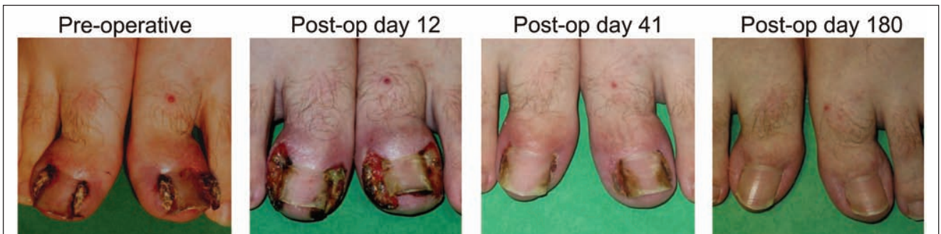
Fig. 3. Images showing healing by secondary intention following surgical nail-fold excision. Post-op = postoperative.